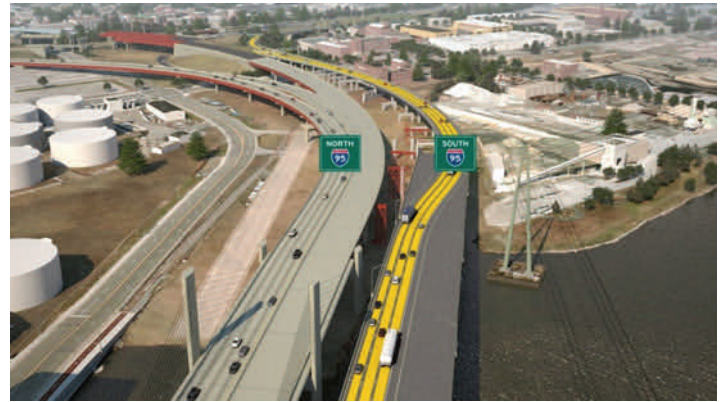
(Above) Photo-realistic visualizations showing change in alignment before (left) and after (right) traffic shift for public outreach.