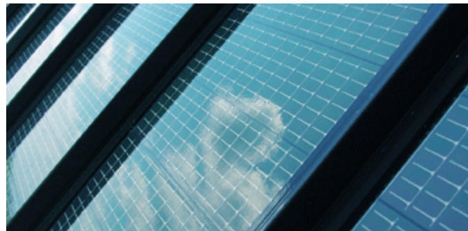
Images of Powerfilm's Flexible Solar Panel Product