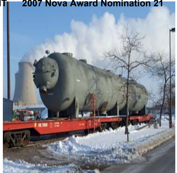
New 113' long MSR spanning two rail cars