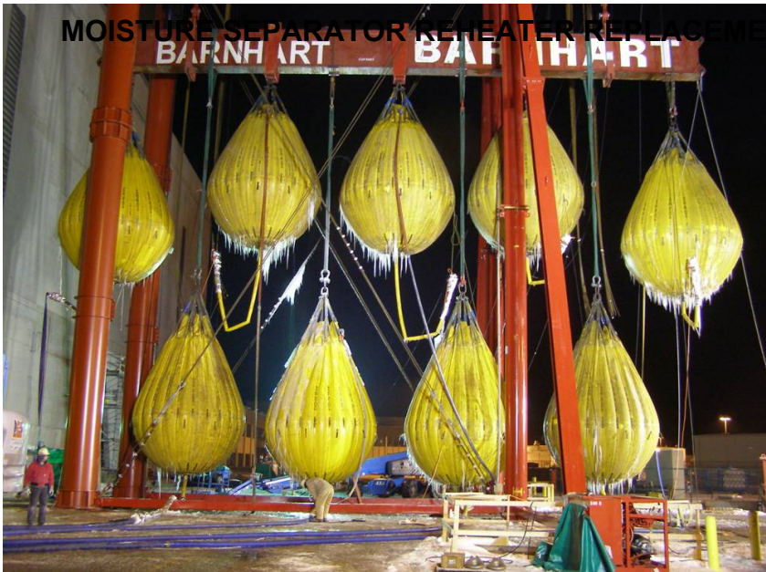
Testing modular lift tower with water weights