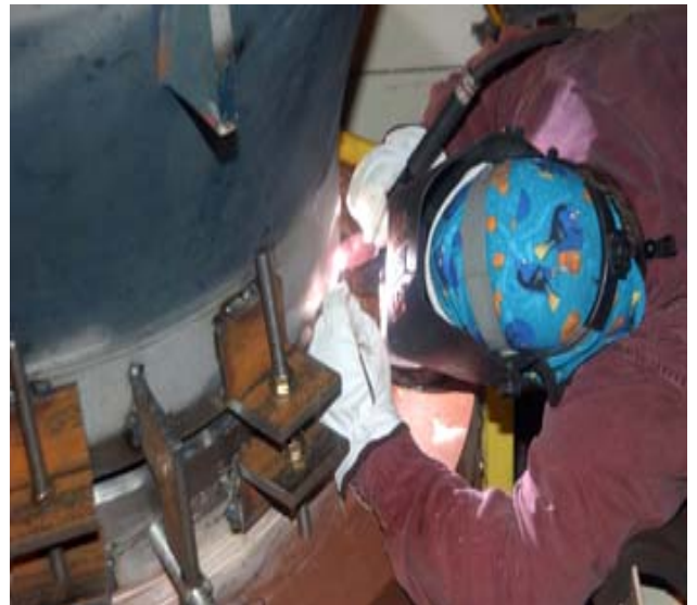
Welding new vessel to 48" piping