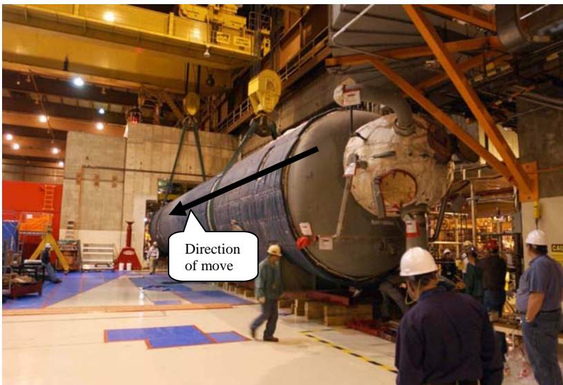
Sliding new vessel into place to 2" clearance