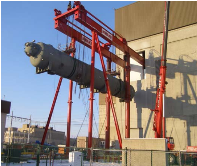
New vessel lift for move into power plant