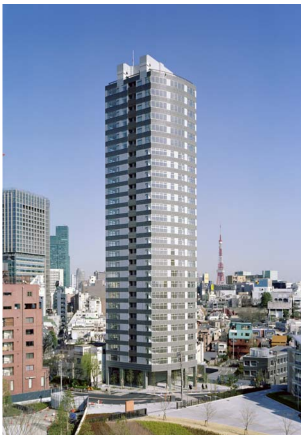
Figure 2: Glorio Roppongi high-rise residential building, located in Central Tokyo, uses ECC coupling beams in core for seismic resistance (Building height: 27-stories, 95m high; built by Kajima Corporation, construction completed in 2006).