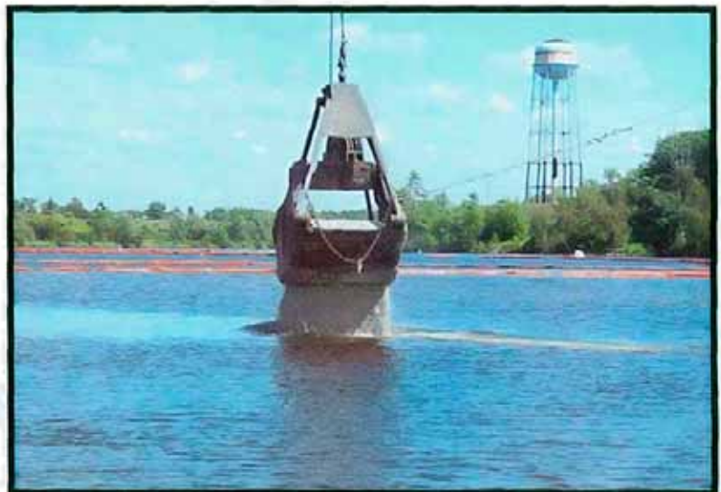
Photo 3 - AquaBlok® placement in Massena, New York using clamshell.