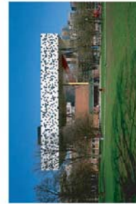
Ontario College of Art and Design Redevelopment Project - Sharp Centre for Design Structural Engineering Development of the