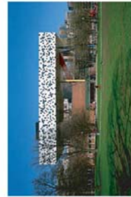
Ontario College of Art and Design Redevelopment Project - Sharp Centre for Design Structural Engineering Development of the