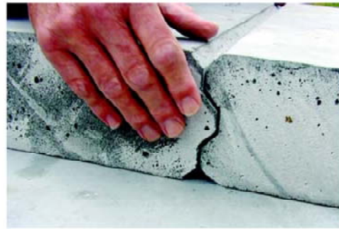
Close up 100 mm HySSIL panels