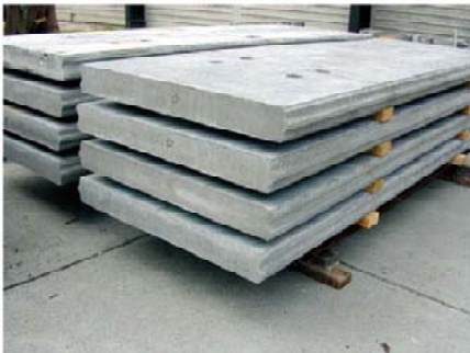
100 mm HySSIL panels prior to erection