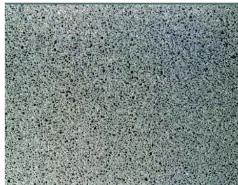
HySSIL cross section Density: 1,400kg/m 3

Contact: Colin Knowles • HySSIL Pty Ltd • 121 Flinders Lane • Melbourne Victoria 3000 • Australia +613-9654-6799 • Fax +613-9654-7356 • colinknowles@hyssil.com • www.hyssil.com