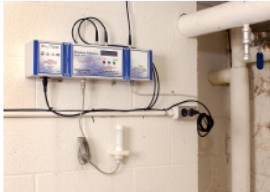
Shown above – Control Unit Installed in a Building..