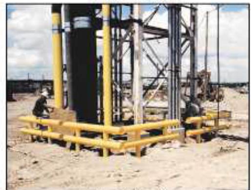
OUTDOOR MACHINE GUARDRAIL

2525 CLARK STREET DETROIT, MI 48209 (888) 308-7290 VISIT US ONLINE @ WWW.IDEALSHIELD.COM