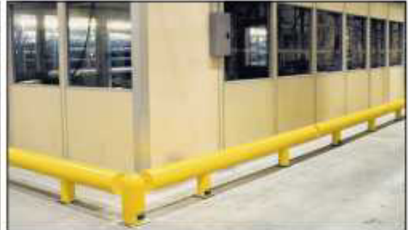
ONE LINE REMOVABLE GUARDRAIL- K-MART DISTRIBUTION