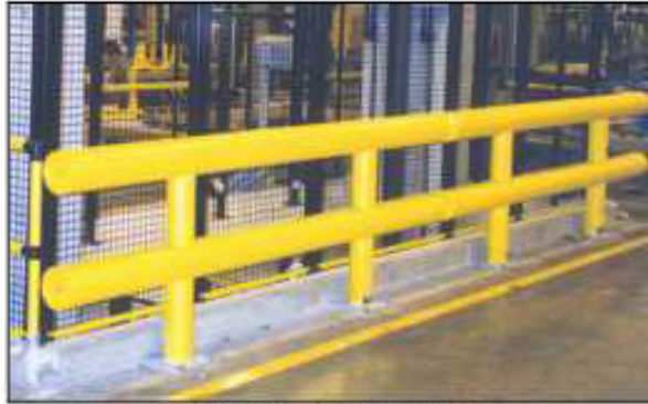
TWO LINE GUARDRAIL- GENERAL MOTORS