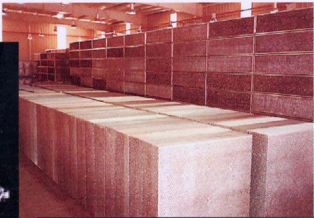
8 ft modules awaiting delivery at Riyadh factory