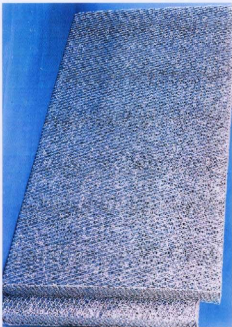
6 inch depth x 6 ft. cladding panels