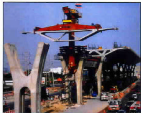
55 kilometers of elevated 6 lane expressway under construction in Bangkok.