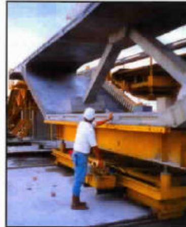
3,500 workers and 78 casting machines form 40,500 precast bridge segments.