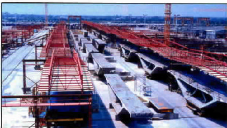
Casting yard for Bang-Na, Bang Pli, Bang-Pa Kong Expressway is the largest in the world.