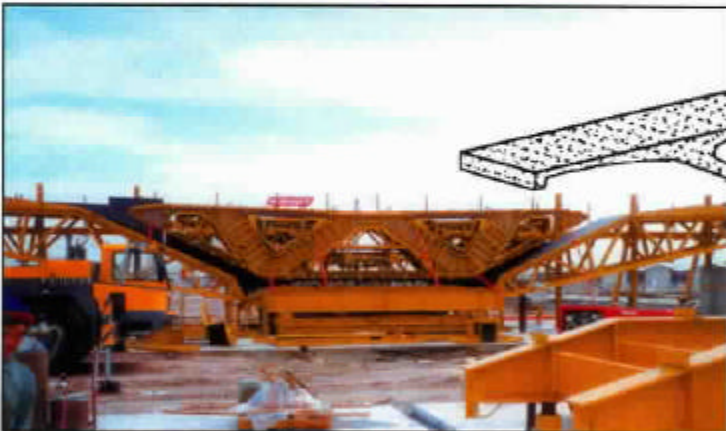
Pier segment casting machine.