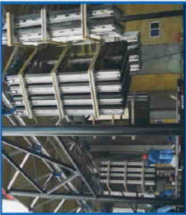
The curtain wall panels (cladding) are stored on a Material Handling Grid below the patented Beeche Aluminum Space Frame System until they are hoisted into position on the building.