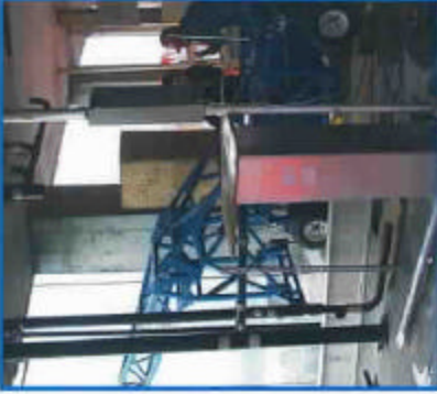
The Beeche Crab™ is positioned to lift panels using the Beeche designed Cable Guide System.