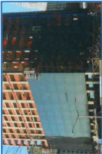
Curtain wall panels are installed with the use of a Beeche designed and fabricated L-shaped corner suspended platform, the patented Beeche Mecano Monorail™, the Beeche Crab™, and other Beeche designed and fabricated assemblies and systems.