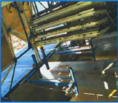
Lifting beam suspended from the patented Beeche Crab™ hoist above, ready to be lifted.