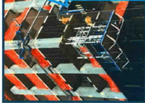
Beeche Engineered Cable Guide System