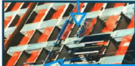
Beeche patented Mecano Monorail