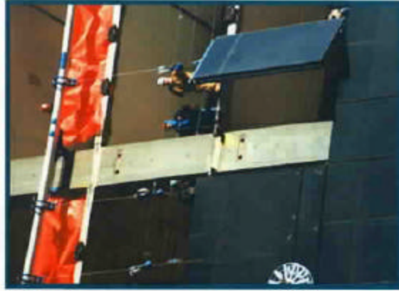
Traversing panels to the installation point on the building