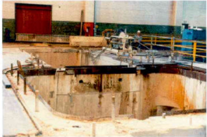
Figure 2 (right). Wire sawing underway. Note small segment of concrete, already removed, left of the operator.