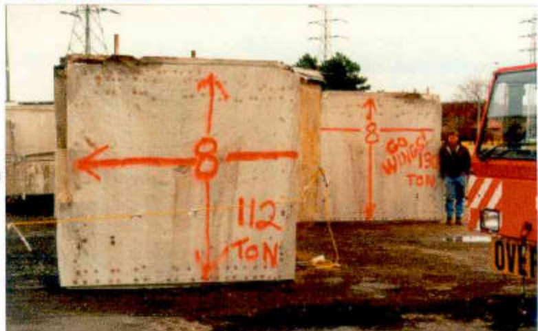
Figure 4 (right). Pieces at rest in field, awaiting further demolition. Construction of new tabletop began the day the last piece was removed from the building.