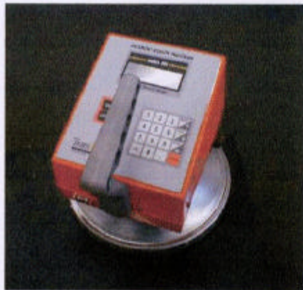
The PQI Model 301