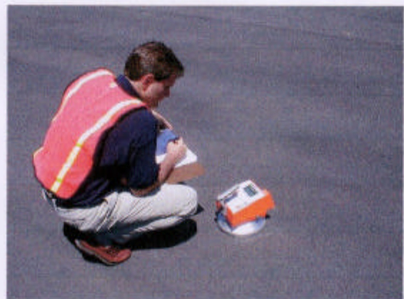
The PQI Model 301 in Use